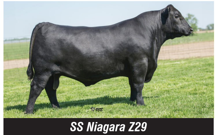
SS Niagara Z29

Great calving ease, carcass, and performance advantages in this attractive young female. Sells with a bull calf at side born 3-5-2024 sired by Woodhill Catalyst.