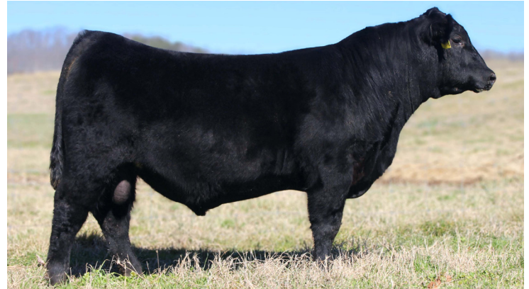
GVF Maga 1008 (MJ) • His Projeny Sell

A productive young Afton daughter tracing to the legendary Pathfinder sire, S A V Final Answer. The best in performance genetics here. Sells with a bull calf at side born 3-16-2024 sired by G A R Dual Threat.