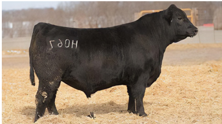
Woodhill Endurance - His Influence Sells

This Poss Rawhide daughter offers great advantages for growth and carcass traits with EPD's ranking in the top 4% weaning, 10% yearling, 30% marbling, 15% ribeye, and the top 4% of the Angus breed for combined Index. Sells OPEN.