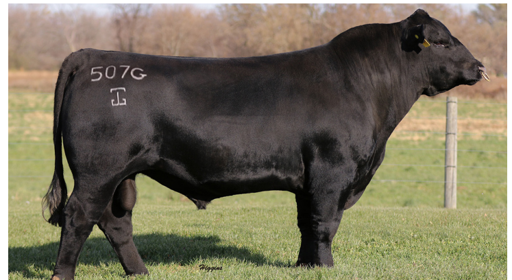
G A R Dual Threat - His Influence Sells

Calving ease, growth, carcass traits, and dollar values all come together in this daughter of Poss Deadwood that ranks in the top 35% or better of the Angus breed for 21 individual traits. Bred 2/3/24 to KA Kindred then exposed to GVF Endurance 2145 from 2/17/24 to 3/30/24.